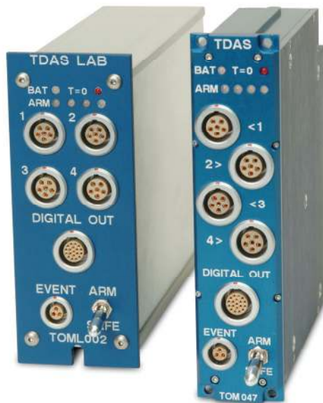
TDAS PRO LAB TOM and TDAS PRO TOM are standalone data recorders that independently fire up to 4 squib channels.

The TDAS PRO Timed Output Module (TOM) from DTS generates precise, high-energy firing signals for a wide variety of squibs used in air bag and pretensioner testing. The system also generates isolated digital outputs often needed to initiate or synchronize other events in the test lab. The TDAS PRO TOM includes 16-bit analog recording of squib voltage and current waveforms.