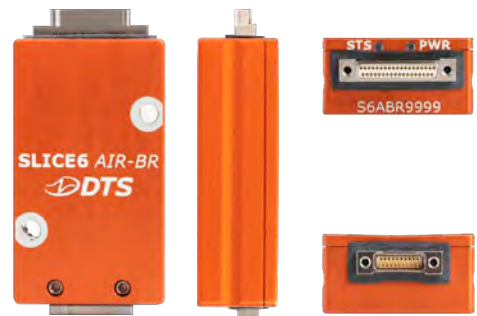
Sensor Inputs Sensor Inputs Sensor Inputs