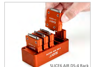
SLICE6 AIR DS-4 Rack